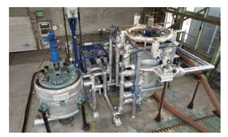
▲ Test center layout

This superior heat flux capability potential of the PI QFlux<sup>™</sup> in addition to its massive overall productivity advantage has a significant effect on the accuracy and rate of change available to operational control and product quality, this effect was easily observed in that the PI