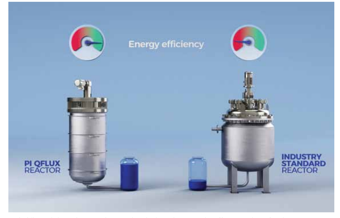
The following link provides an introduction to the technology infrastructure: https://www.youtube.com/watch?v=PzRmtHKJwpo

degree of design adjustment and tuning even before the first materials were fully specified or cut. This fully integrated computer design modelling combination allowed PTSC to go from conceptual design to full scale detail design without passing through an intermediate scaled or prototype step.