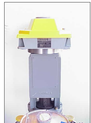
Gearbox upgrade complete