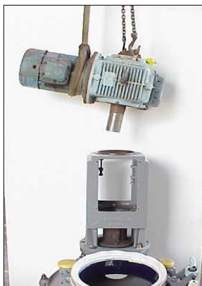
Removal of old gearbox