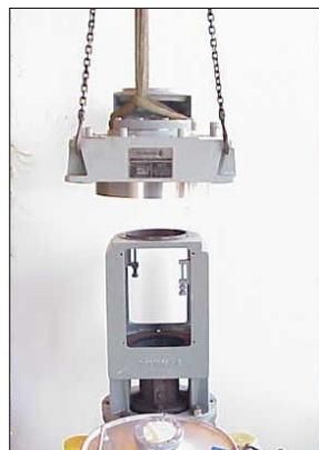
Assembly of DeDietrich GEAR-UP® to existing pedestal