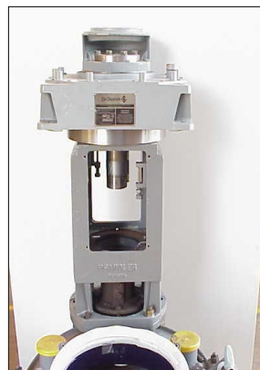
De Dietrich gearbox with output shaft mounted on pedestal