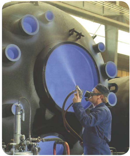
Enamel is sprayed like paint on the surfaces to be glass-lined