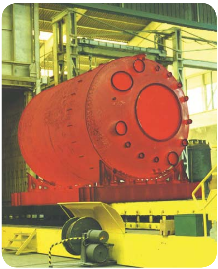
Vessel is fired at high temperatures in an electric furnace