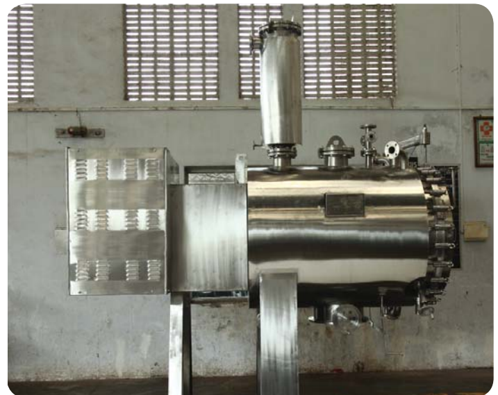
1500 L Rotary Vacuum Paddle Dryer Pharma Series with GMP design.