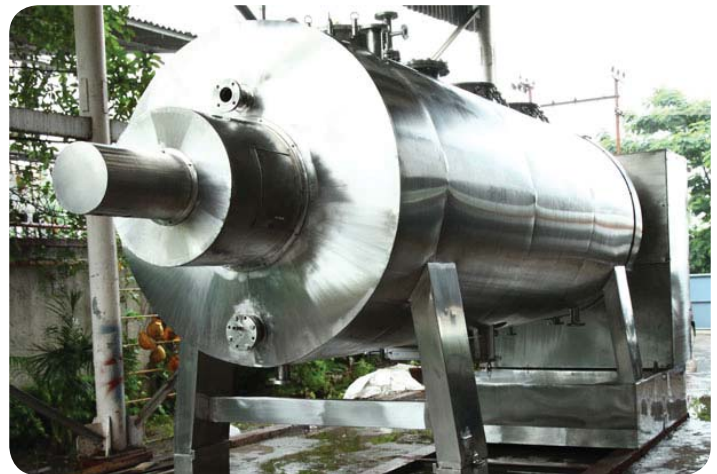
15,000 L Rotary Vacuum Paddle Dryer with simple support.