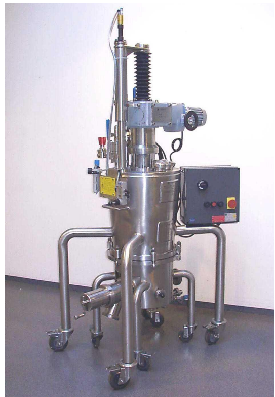
RoLab 0.03m 2