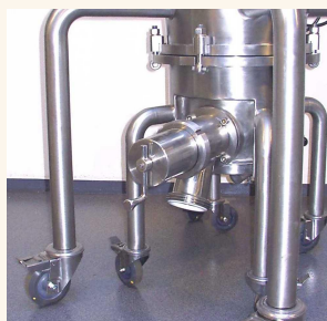
Side discharge valve